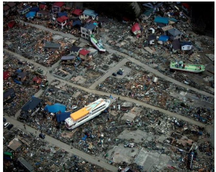
A large ferry boat rests inland amidst destroyed houses after an earthquake and tsunami struck Japan on 11 March 2011.

is getting smaller and smaller,” he said. “On the other hand, the radioactive contamination of soil, water, air, and foods, which may cause internal exposure, is still a big concern. Although I am not specialized in radiation-related health risk, I guess that normal people, other than nuclear plant workers, are not at a significant cancer risk, while the risk due to long-term exposure, including internal exposure through contaminated soil, dust, water, and foods, is uncertain.