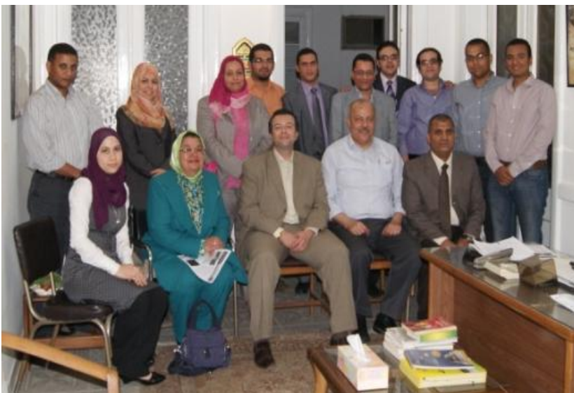
The first official meeting of SRA-Egypt, held 16 April 2011

The latest newsletters for SRA-Egypt are located at http://sra-egypt.org/?section=pages&nID=MzA .