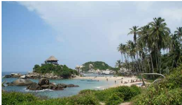
Colombian landscapes, among the best attractions worldwide!

We are all actively engaged in succeeding in two major tasks. First, we need to increase our visibility in order to expand our membership. Second, we want to provide more benefits to our members regarding facilitation of opportuni-