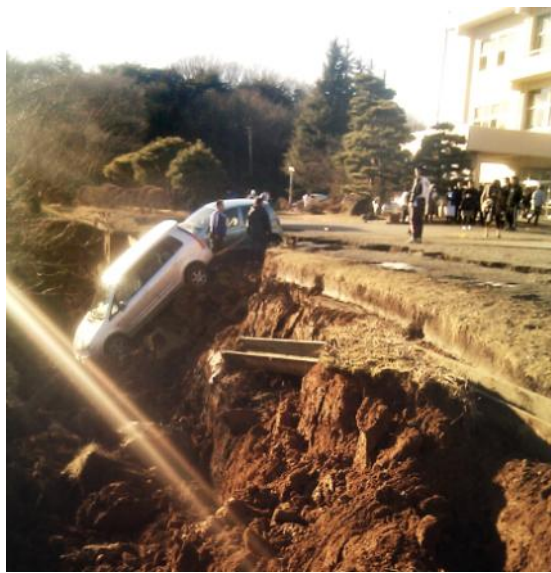
Vehicles are crushed by a collapsed road at a car park in Yabuki, in southern Fukushima Prefecture, on 11 March 2011 after the earthquake in Japan.

Watanabe also said that it would probably be helpful if others, such as SRA members, could help