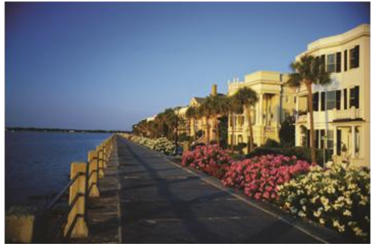
The Battery in Charleston

Mark your calendar and join your colleagues and friends for the 2011 Society for Risk Analysis (SRA) Annual Meeting 4-7 December 2011 at the North Charleston Convention Center and the Embassy Suites North Charleston Hotel in Charleston, South Carolina. Strong submissions have produced an excellent program, with over 350 oral presentations, distinguished plenary speakers, and a stellar poster session. Whether your interests are in food safety or sea-level rise, nanomaterial toxicity or the aggregation of expert judgments in risk analyses, Deepwater Horizon or new developments in risk management and sustainability, the program offers something for you. Building on last year’s successes, there will be professional development opportunities for young risk analysts and a career fair. It’s not too late to submit if you missed the deadline! The SRA website will open again in August for poster submissions on late-breaking research.