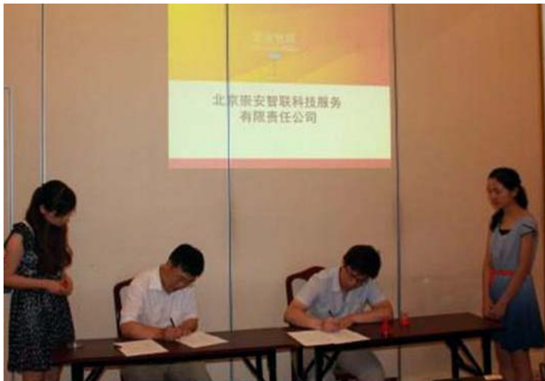
SRA-China and Beijing Cazl Technology Service Co., Ltd., signing the Overall Cooperation Agreement

In June, the Development Department realized a road-condition model in an experimental IOI, bringing forward concepts of a demand customization tool, experience express tool, and experience zoning map of the online version. It provides an important entity product model to achieve the goal of experience service in IOI. The road-condition model product is being developed, and we expect forms and services to be online at the end of this year.