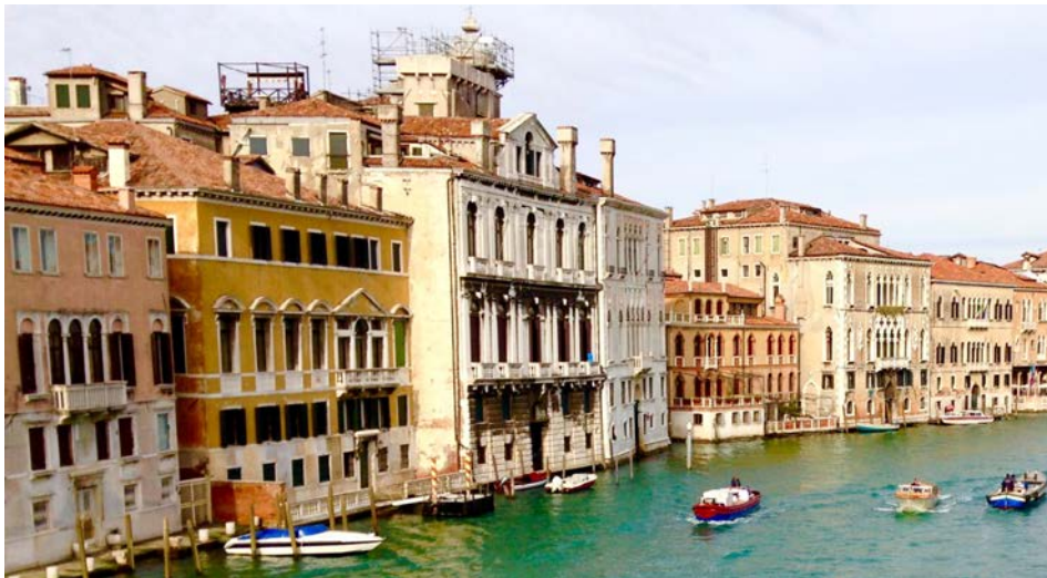
Venice, Italy.

The new deadline is 15 November to submit abstracts for the SRA Policy Forum: Risk Governance for Key Enabling Technologies to be held on 1-3 March 2017 in Venice, Italy.