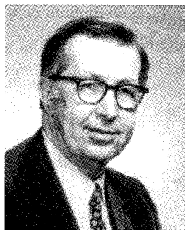
Paul F. Deisler Jr. Life Sciences