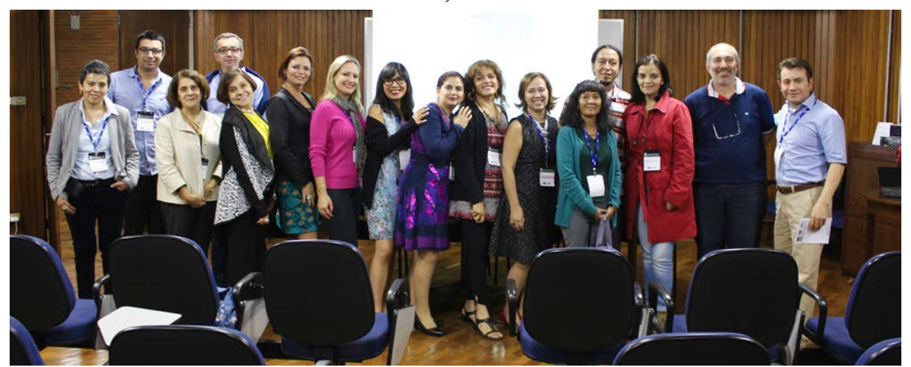
Participants gather for a photo at the SRA Members Meeting during the Congress.