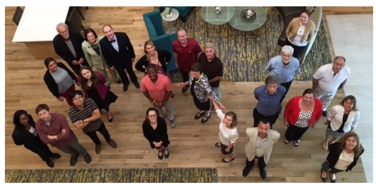
SRA Program Committee, Tysons Corner, Virginia.